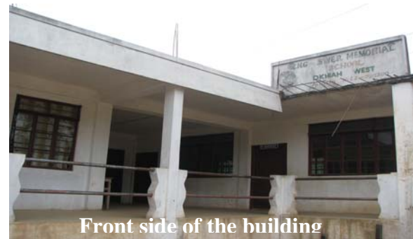
Front side of the building

Date of commencement – The work had already started before getting the sanction with the available fund of the school