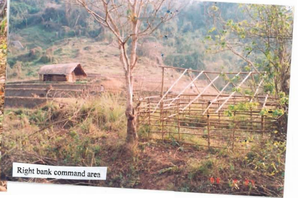
Right bank command area