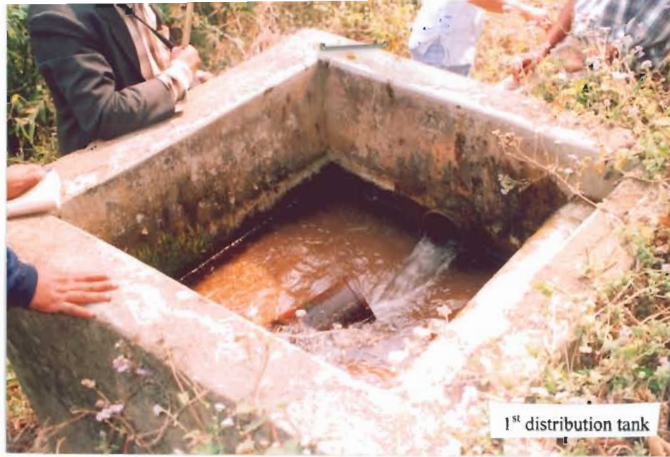
1 st distribution tank

There is only one Khalasi looking after the project. Limited fund is available for maintenance.