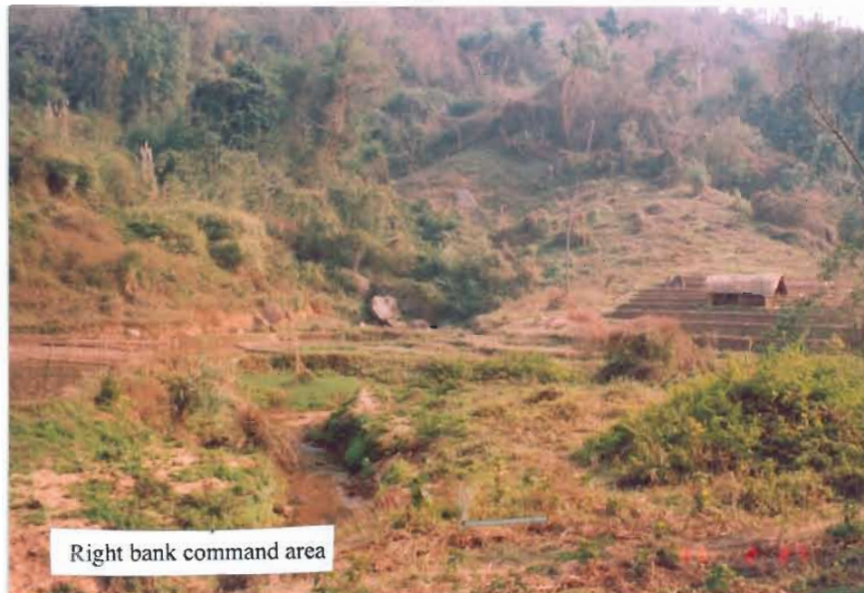
Right bank command area