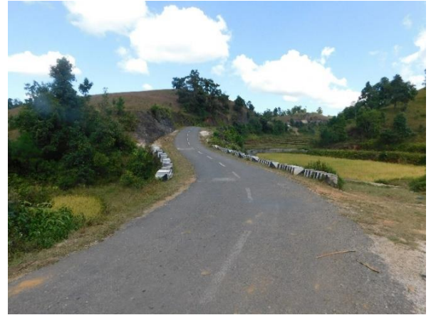
Black Topped Road