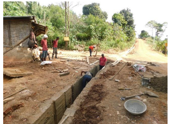
Men at Work