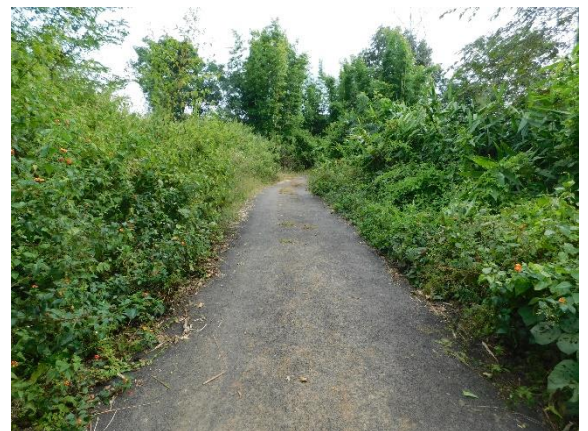
Thick vegetation on both sides of