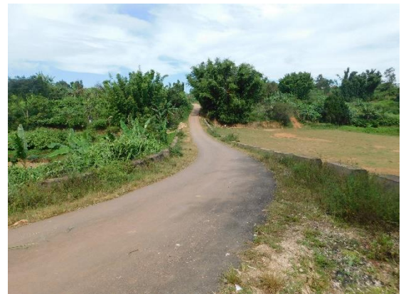
Black topped Road