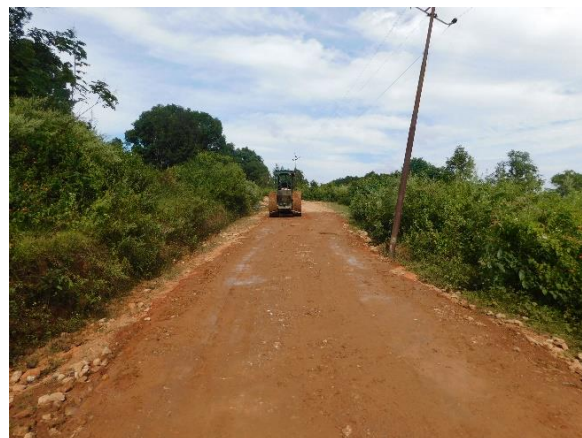
Wet Rolling of the road

20) Impact of the scheme:- On completion of the project there will be an overall development in the socio economic conditions of the people living in the rural areas by way of transportation of agricultural and forest products to the markets.