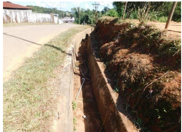
Pucca Side Drain

21) Impact of the scheme: - With good road connectivity there is an overall development in the socio-economic conditions of the people living in the rural areas by way of transportation of agricultural and forest products to the market.