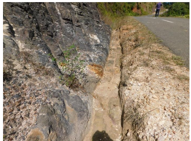
Kutchra Side Drain

18) Suggestions:- Signboard shows the date of completion as 24/12/2015, whereas the work is completed on 28/2/2017. Hence, the AEE who accompanied the Inspection Team was advised to instruct the Contractor concerned to write the actual date of completion on the Signboard and 5 (five) years maintenance should start with effect from 28-02-2017 which is the actual date of completion.