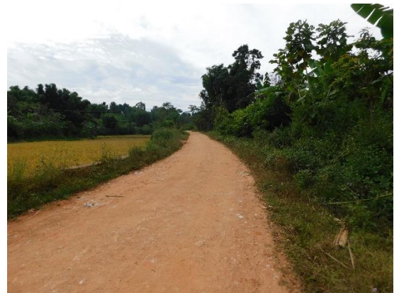
Water Bound Macadam (WBM)