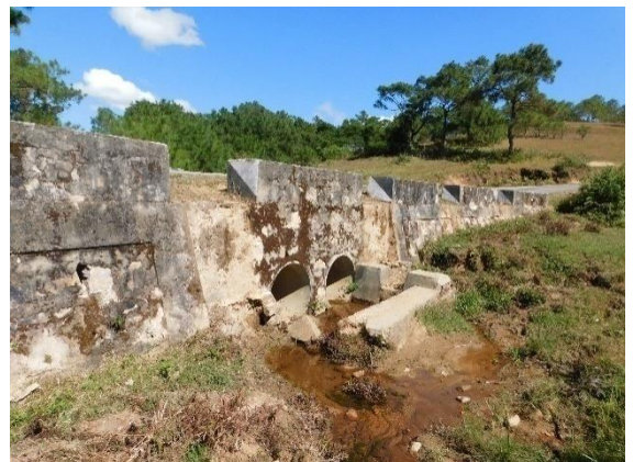
Retaining Wall and Hume Pipes