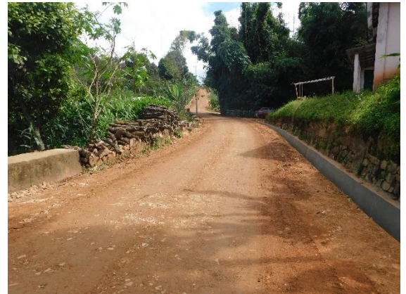
Water Bound Macadam (WBM) road

16) The length of the motorable road connecting from 13 th Km of NJB Road to Lathymphu village is 3.185 KM.