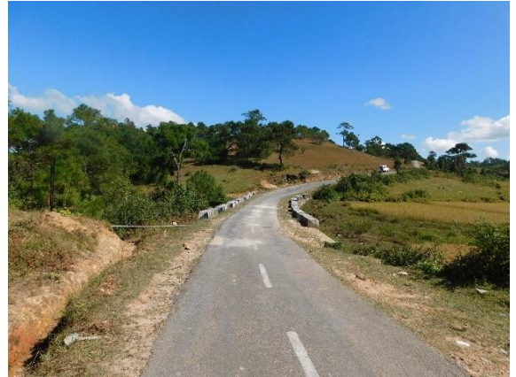
Completed Black Topped Road