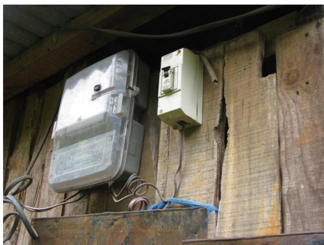
Smt. Neta Khyllait