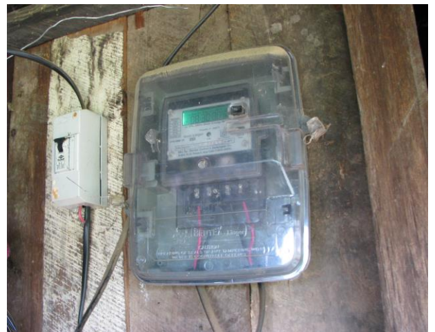
Shri Pherbit Basaiawmoit