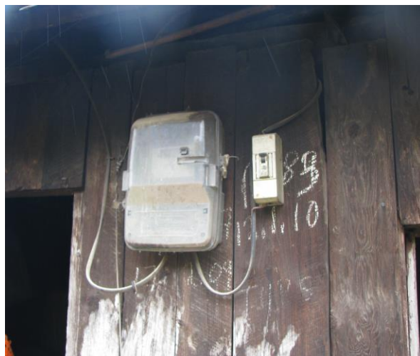
Smt. Sila Nongbri