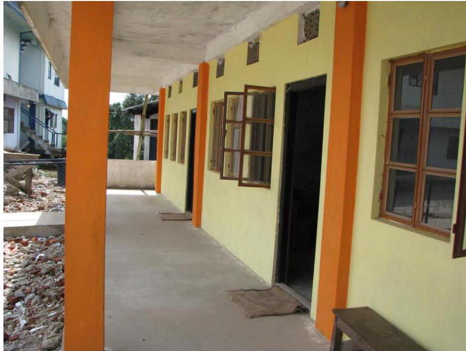
School Building and toilet constructed under SSA.

Managing Committee may approach SSA authority for getting additional building grant.