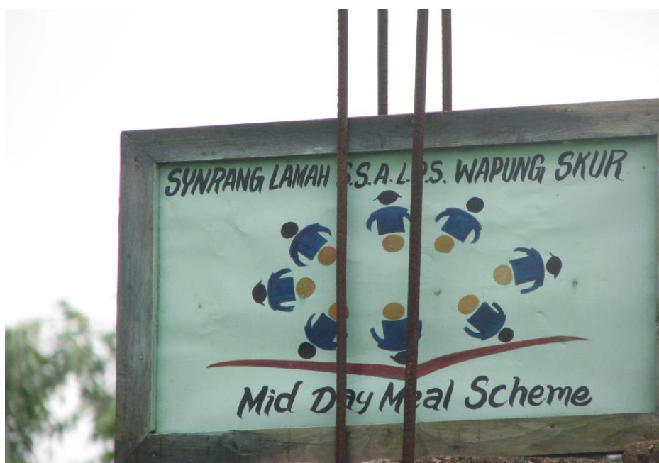
School Building constructed under SSA

The Secretary of the school was advised to approach the SSA authorities for getting fund required for additional building and Maintenance Grant. As for toilet and drinking water facilities the Management may approach the PHE office in the District for providing these facilities.