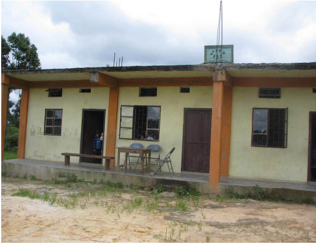
School Building constructed under SSA.