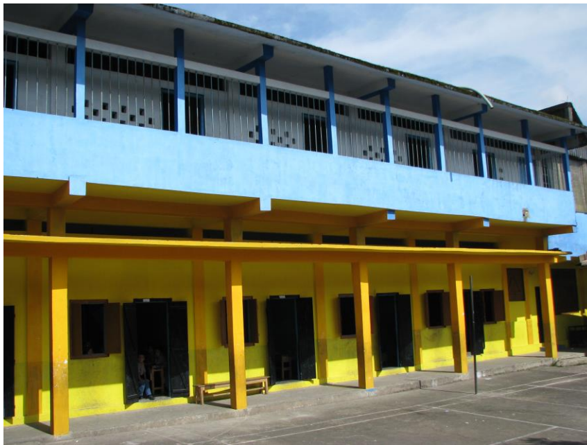
Ground Floor of the School Building and toilets constructed under SSA

The Secretary was advised to seek out the possibility of appointing more teachers from other sources.