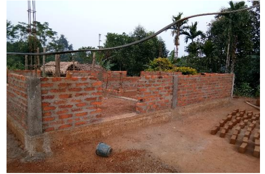
IAY house under construction