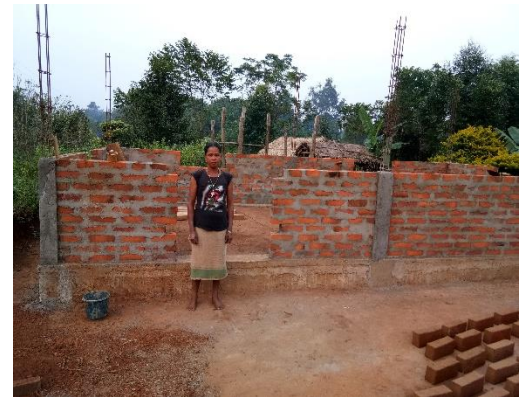
A Beneficiary infront of her under construction IAY house