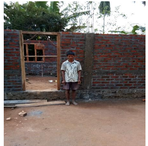
A beneficiary in front of his under construction IAY house