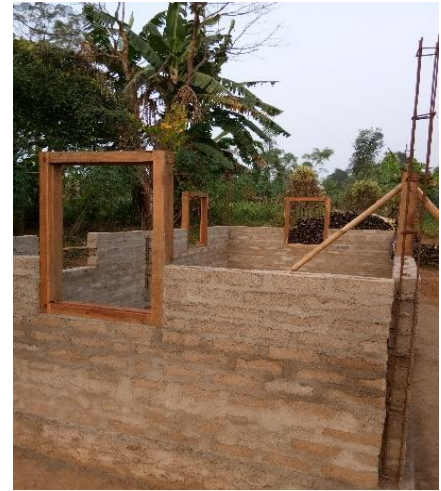
IAY house under construction