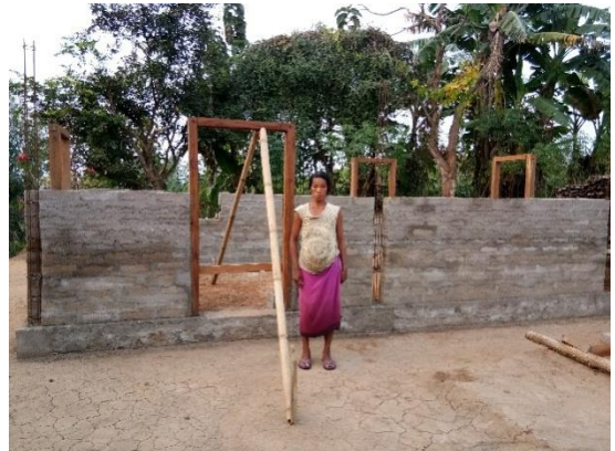
A Beneficiary in front of her under construction IAY house