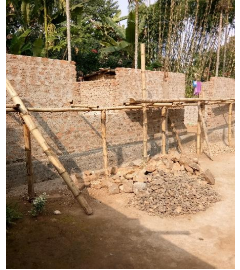
An IAY house under construction