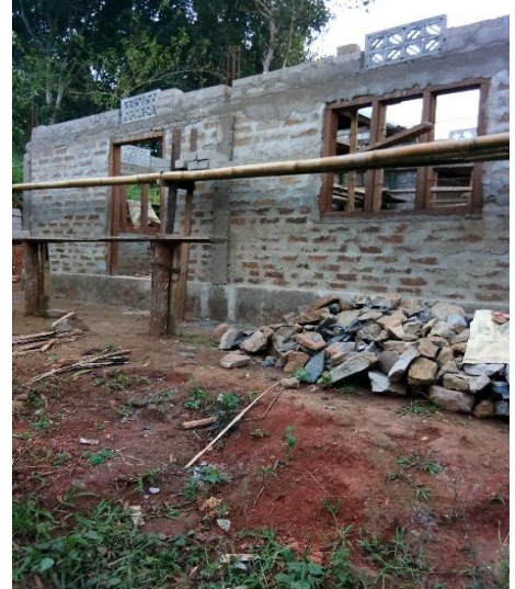
IAY house under construction