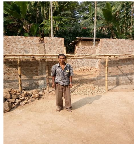
A beneficiary in front of his under construction IAY house