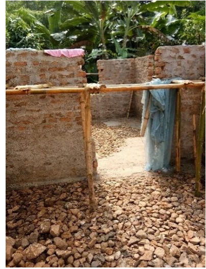
IAY house under construction