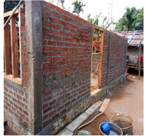
An IAY house under construction