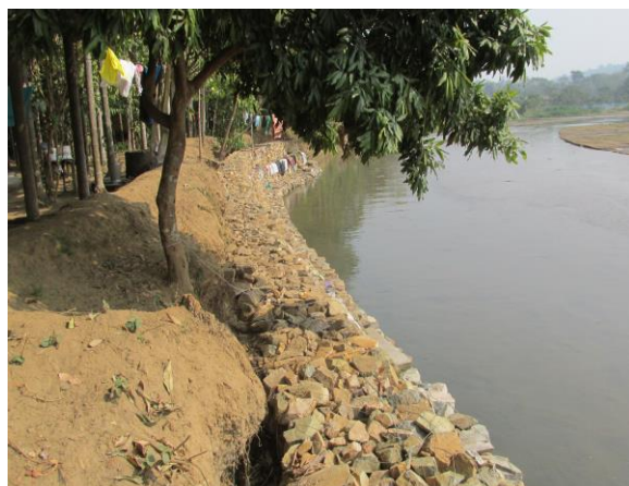
Boulder Sausage under construction