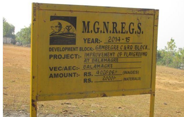
A sign board