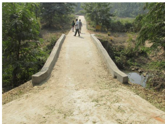
CC Jeepable Road