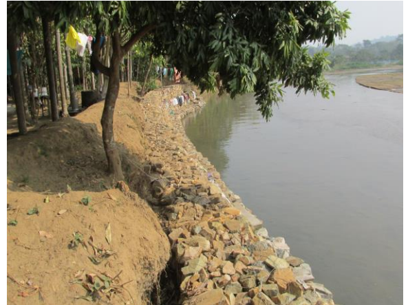
Boulder Sausage under construction