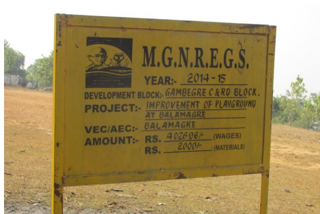
A sign board