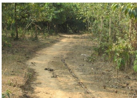
A Kutchha Road