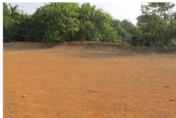
An improved Playground