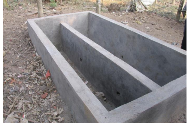
Vermi Compost Pit