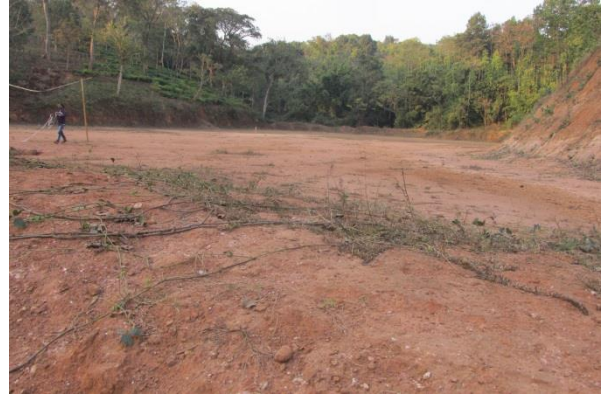
Playground at Chidekgre