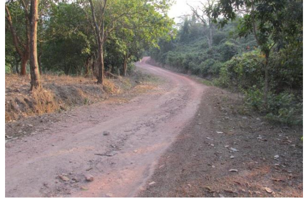
A completed kutchha road