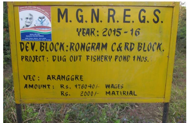
A Sign Board