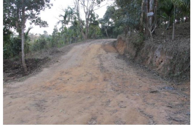
A kutchha Road