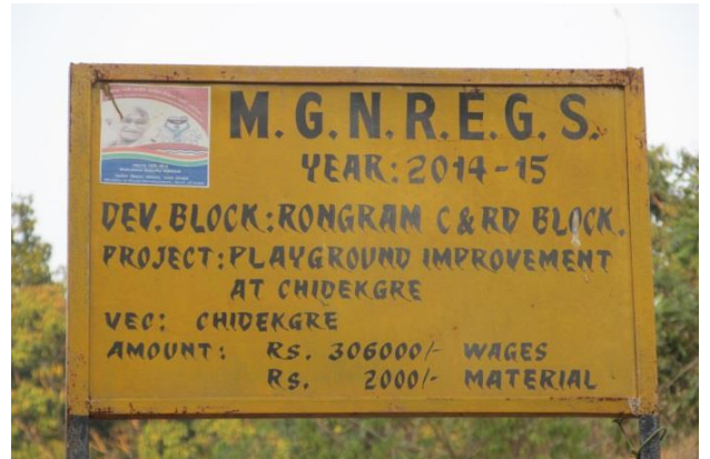
A Sign Board