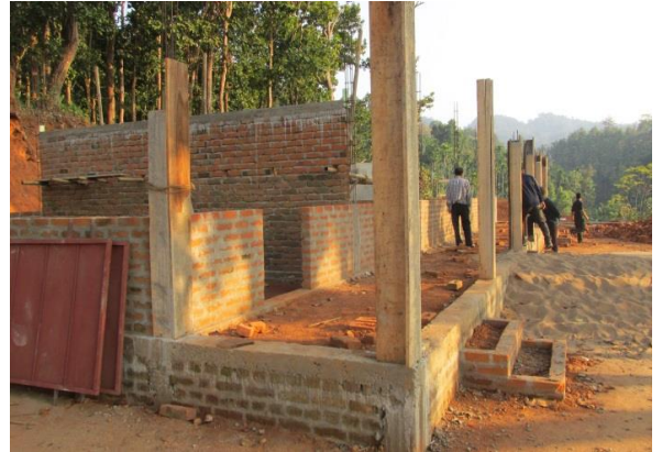
BNRGSK building under construction