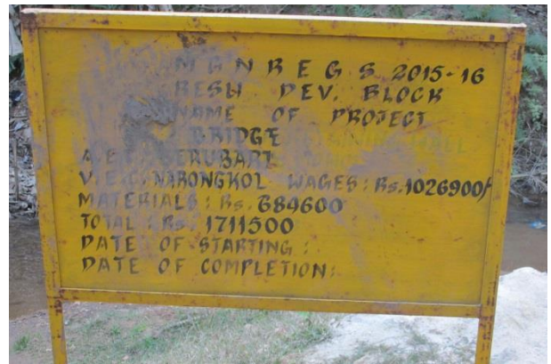
A Sign Board