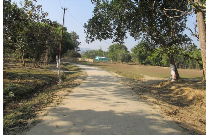
A C.C. Road