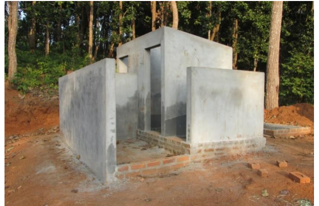
A Toilet under construction