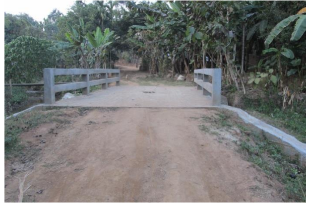
A motorable bridge