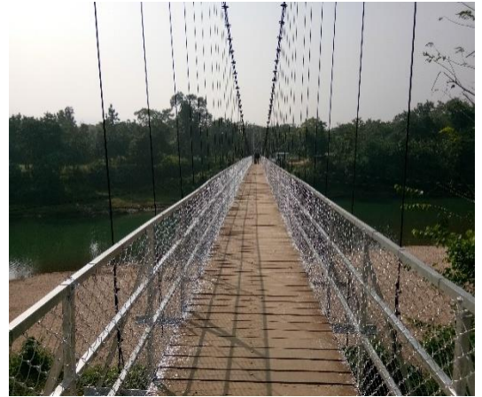
A suspension Foot Bridge