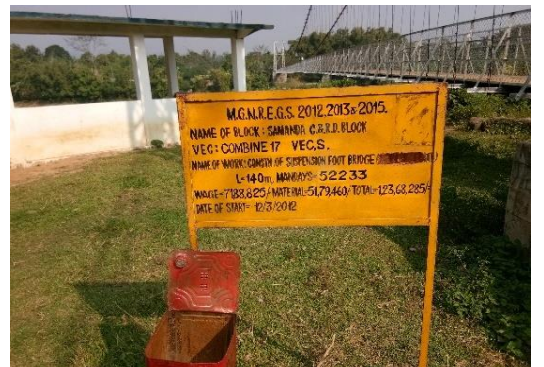
A sign board