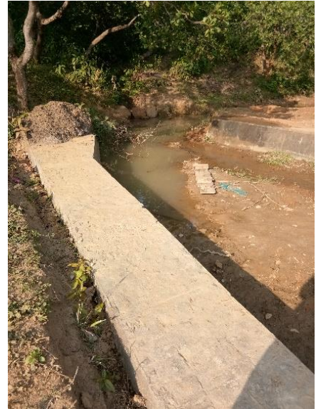
C C. Check Dam