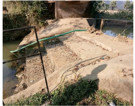
CC Check Dam