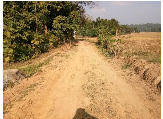
An improved Kutchra Road