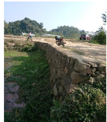
A Protection Wall