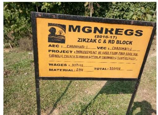
A sign board