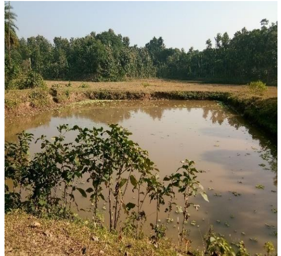
Dug Out Fishery Pond