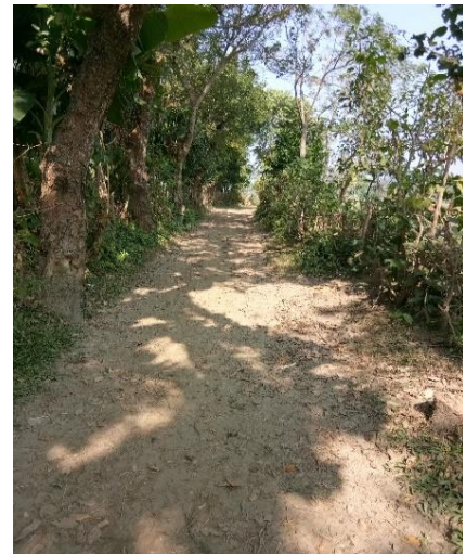
An improved Kutchra Road