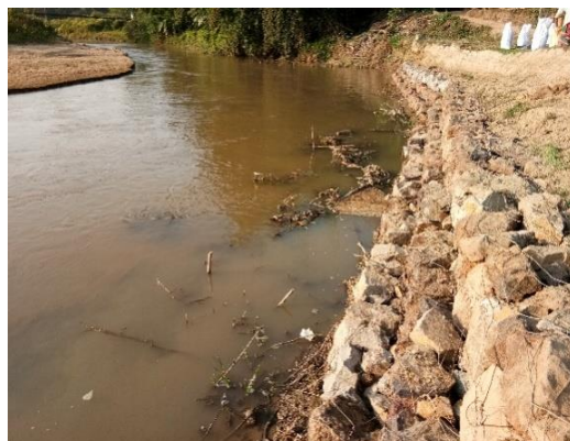
Boulder Sausage and earth filling