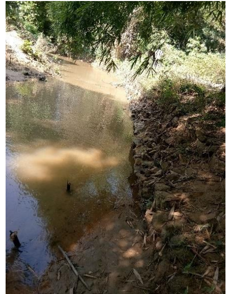
Boulder Sausage Embankment