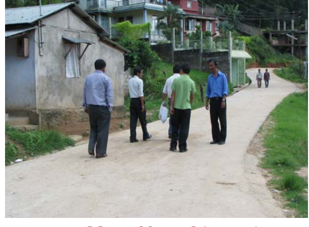
Motorable road (cement)