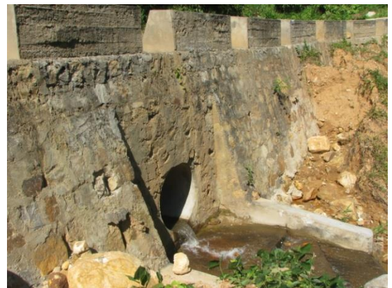
Hume Pipe & Retaining wall