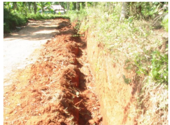
Kutcha Side Drain