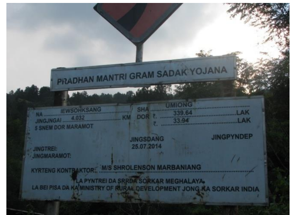
Sign board of the road

19) Suggestions:- The AEE. i/c was advised to monitor the work regularly so that the work will be in steady progress.