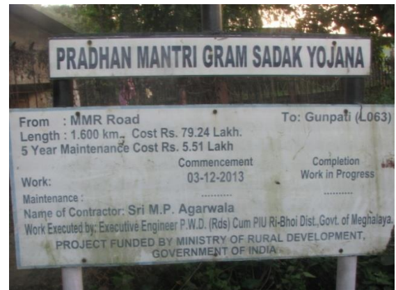
Sign board of the road

19) Suggestions:- The AEE i/c was advised to carry out repairing and maintenance work so as to avoid further deterioration of the road.