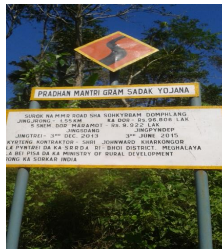
Sign board of the road

19) Suggestions:- The AEE. i/c was advised to monitor the work regularly so that the work will be in steady progress.