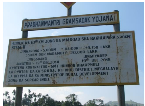
Sign board of the road

19) Suggestions:- The AEE. i/c was advised to monitor the work regularly so that the work will be in steady progress and also to carry out the work for site clearance.