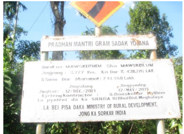
Sign board of the road

19) Suggestions:- The AEE. i/c was advised to monitor the work regularly so that the work can be completed within the stipulated time.