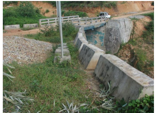
RCC Bridge and Guard Wall