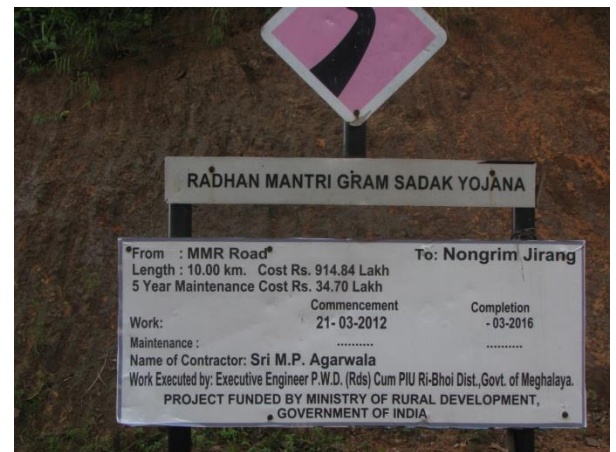
Sign board of the road

19) Suggestions:- It is suggested that work for Jungle Clearance is required to be carried out.