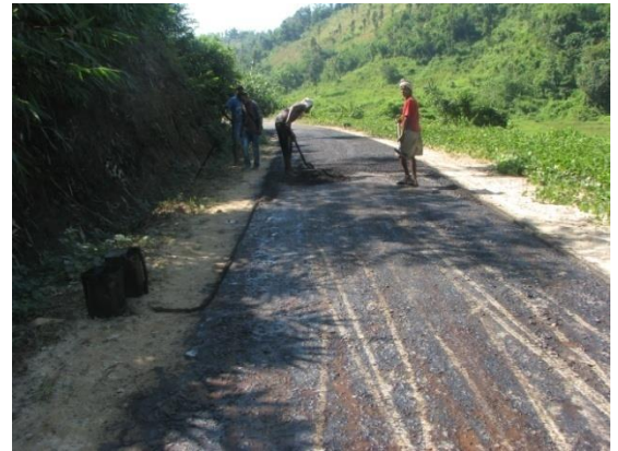
Laying of BT Layer in progress