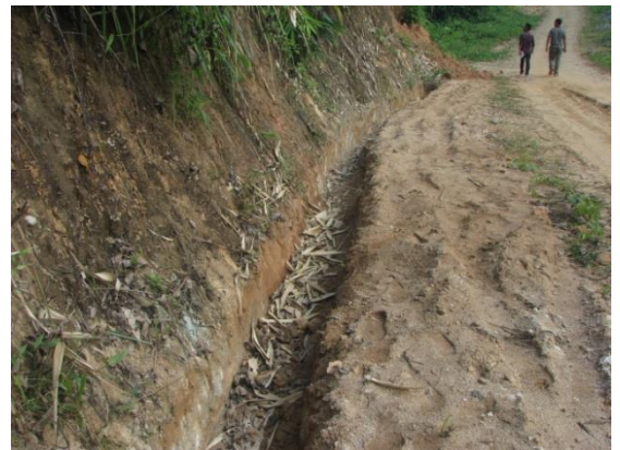
Kutcha Side Drain