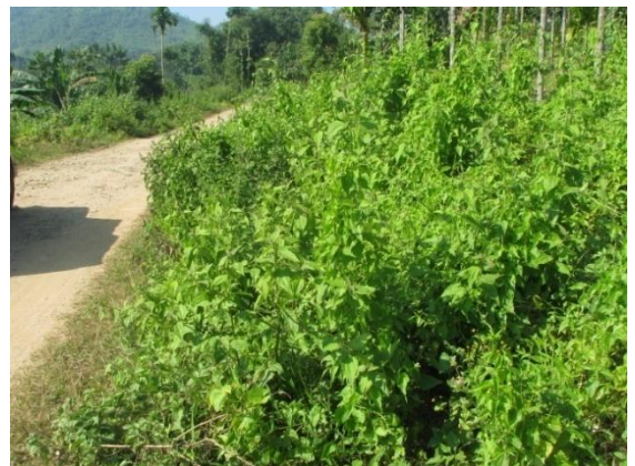
Side Drain yet to be cleared