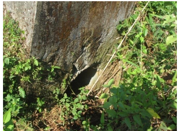
Hume Pipe yet to be cleared