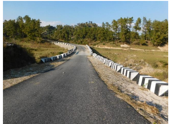
Black Topped Road