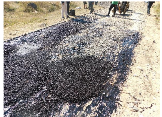
Segregation of Wearing Course