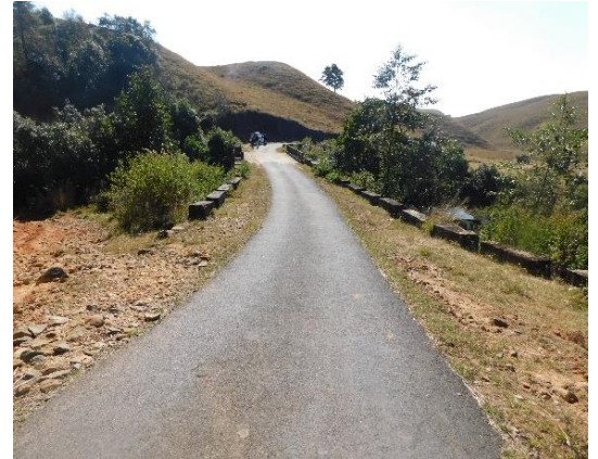
Black Topped Road