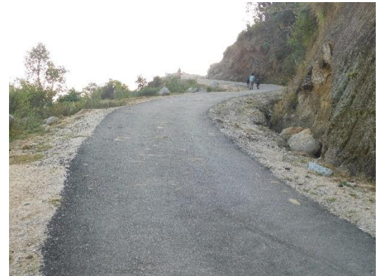
Black Topped Road