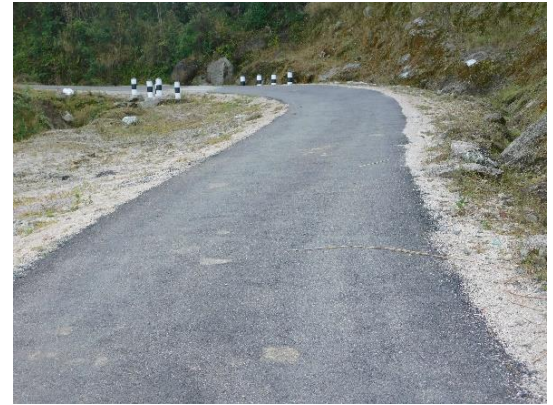
Black Topped Road