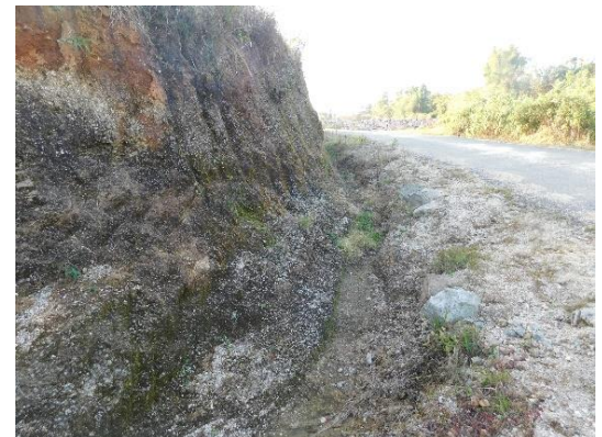
Kutchra Side Drain