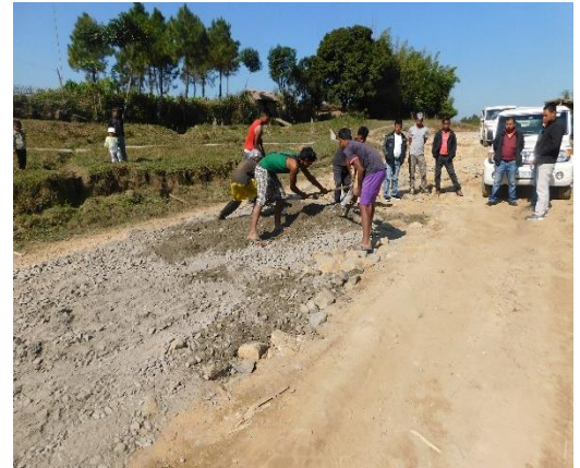
Laying of Granular Sub Base

20) Suggestion:- The AEE, i/c was advised to see that the work is in steady progress so that the work can be completed within the stipulated time.