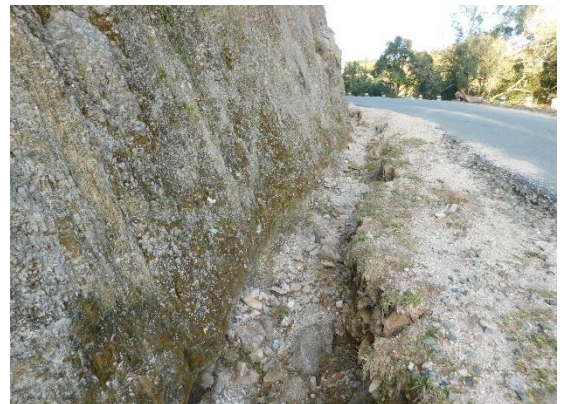
Kutcha Side Drain