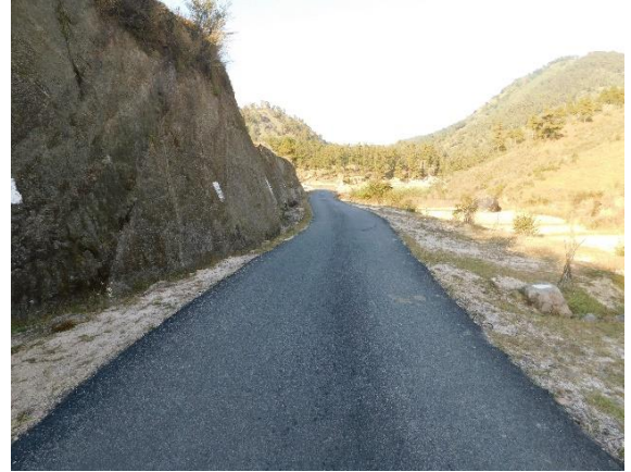
Black Topped Road