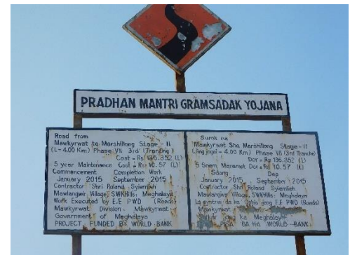
A sign board

20. Suggestion:- The AEE, i/c was advised to see that the work is in steady progress so that the work can be completed within the stipulated time.