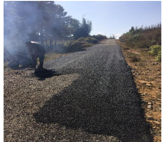
Laying and compaction of 20 mm Pre Mix Carpet