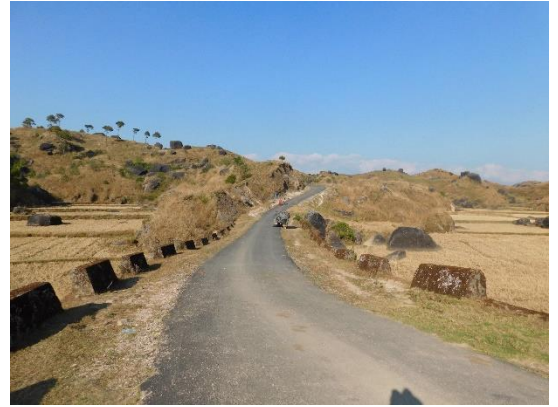
Black topped road