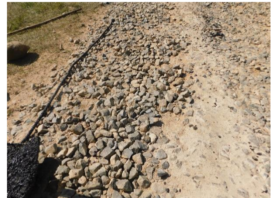
Base Course without Compaction