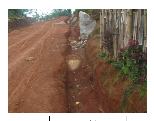
Side Drain of the road